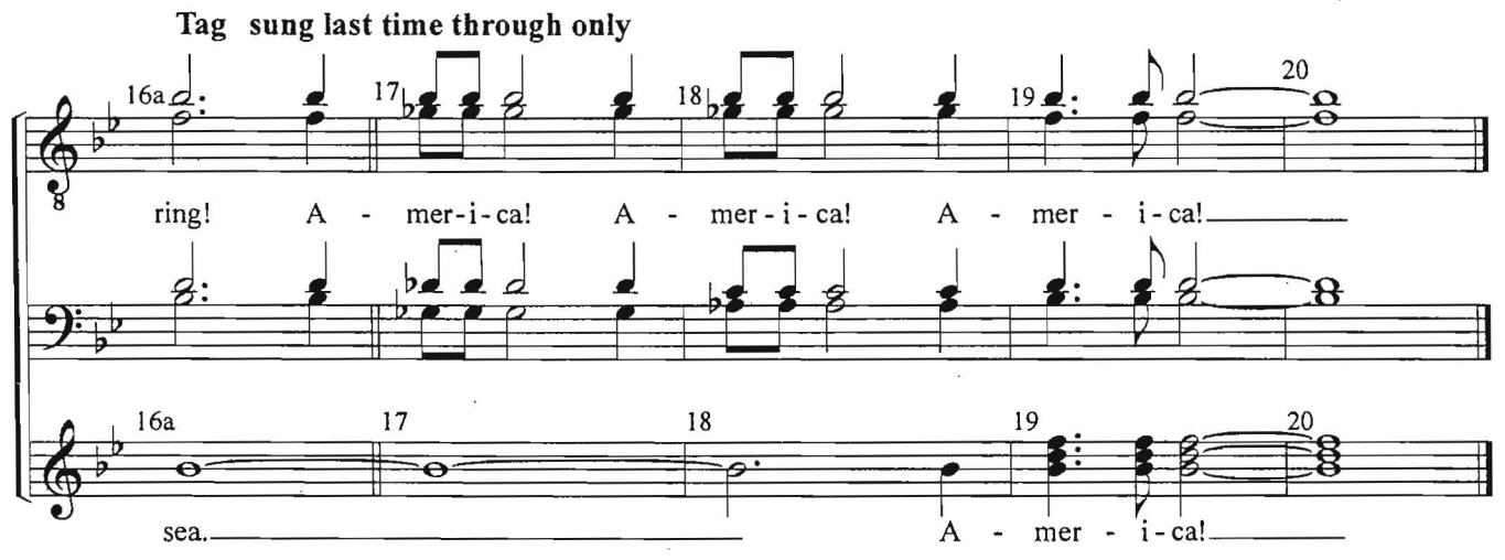
If female voices are performing, have them divide for harmony